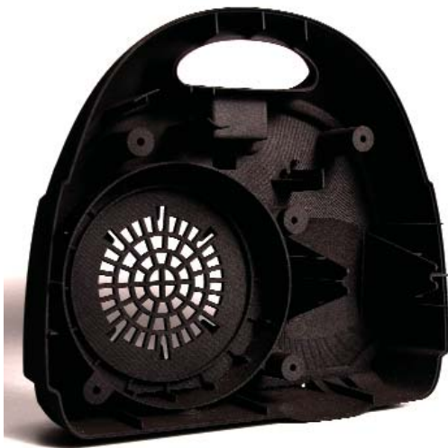
One-part, black powder contributes to uniform black color.